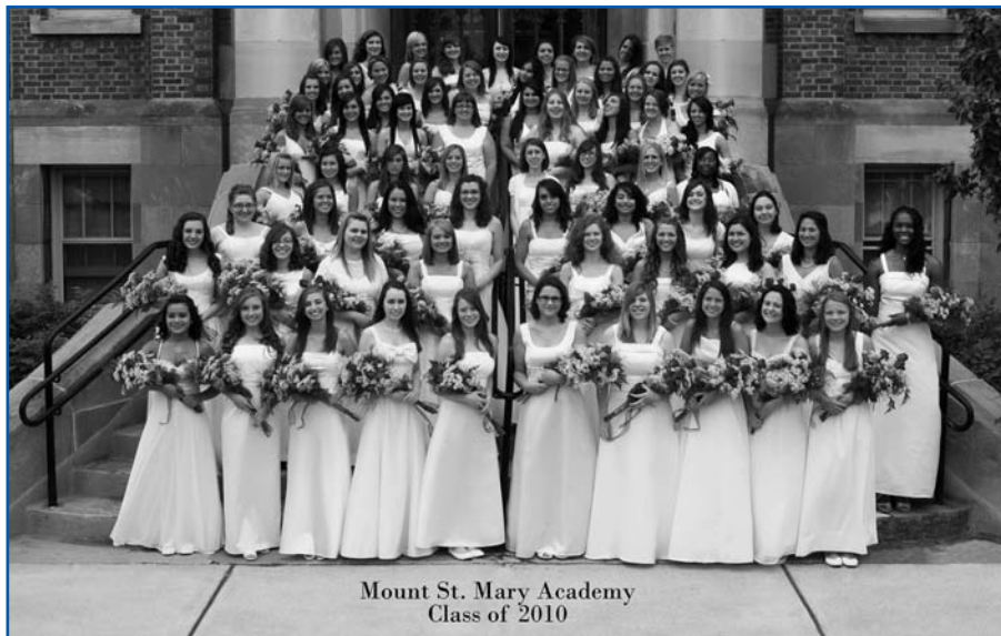
The Class of 2010 on the steps of MSM.