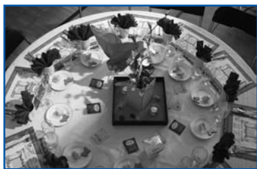
An inspiring tablescape promises a delicious dinner.

If you missed this year's event, make sure you can join us next year. Save the date April 2 and we'll see you at the Chrysalis!