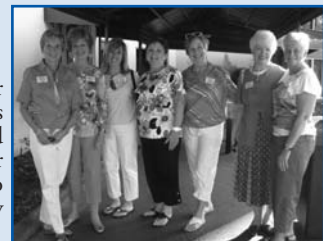
Old friends reunite in sunny Florida.

The band, dance team and color guard performed poolside during cocktail hour and wowed our Southern Sisters. A group of 1960 grads thought they were fantastic and were amazed that the band sounded so good considering so many students had just started playing. “All we got to do was sing-you didn’t have an option...everyone had to sing,” one alumna commented.