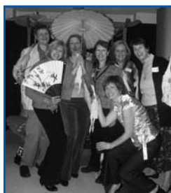
1975 classmates yuck it up.