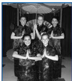
MSM students pose in the photo booth.