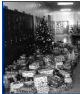
This Christmas, MSM students collected 291 gifts for the children of St. Luke's Mission of Mercy.